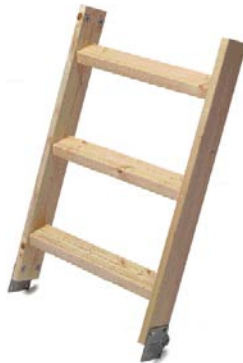
Extensions For extra high ceilings. Available in wood or aluminium.