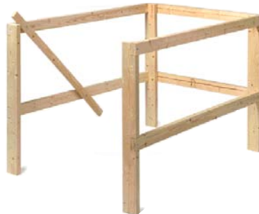
Guardrail Safety in the attic. Available in wood or aluminium.