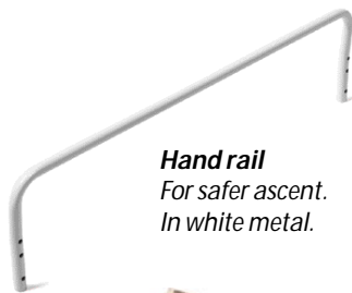
Hand rail For safer ascent. In white metal.